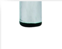
Non-marking, hard wearing nylon feet.