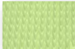
Anti-microbial Premium Foam